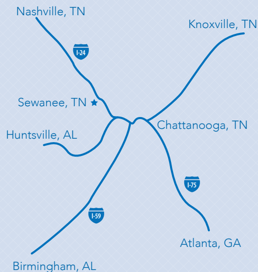
St. Andrew's-Sewanee is centrally located between Nashville, Chattanooga, and Huntsville.

Set on the edge of the Cumberland Plateau between Nashville and Chattanooga, St. Andrew's-Sewanee School covers 550 acres and features fields, forests, bluffs, caves, and waterfalls. Our stunning campus is our interactive classroom and the very heart of our community.